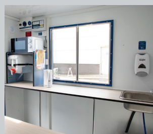
Delivery of hot water