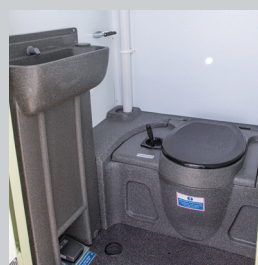
Toilet wash area