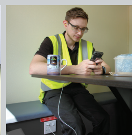
Inverter powered USB sockets